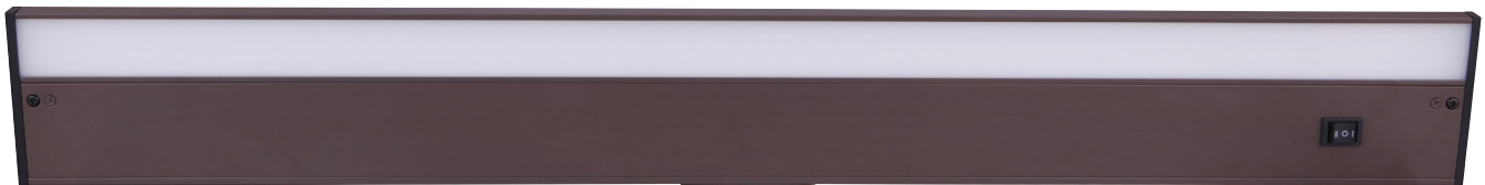
CUC1036-BZ-LED - 36" Light Bar 18 Watt LED; 1200 Lumens, 3000k, 90 CRI Dimmable 36"L x 3.63"W x 1"H; Frosted Polycarbonate Lens Finishes: BZ, W