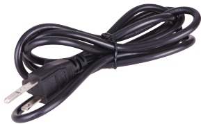
CUC10-PG5-BLK - 5' Cord w/Plug Finishes: BLK, W