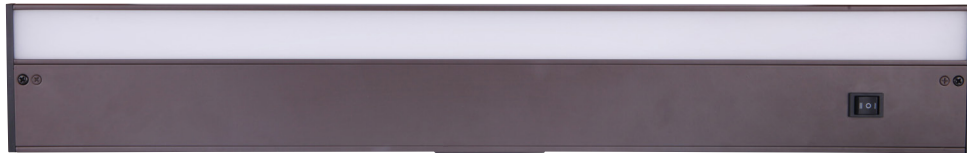
CUC1024-BZ-LED - 24" Light Bar 12 Watt LED; 840 Lumens, 3000k, 90 CRI, Dimmable 24"L x 3.63"W x 1"H; Frosted Polycarbonate Lens Finishes: BZ, W