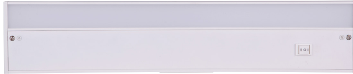
CUC1018-W-LED - 18" Light Bar 9 Watt LED; 600 Lumens, 3000k, 90 CRI, Dimmable 18"L x 3.63"W x 1"H; Frosted Polycarbonate Lens Finishes: BZ, W