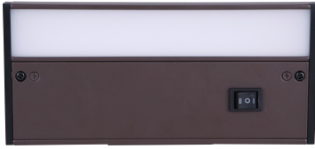
CUC1008-BZ-LED - 8" Light Bar 4 Watt LED; 250 Lumens, 3000k, 90 CRI, Dimmable 8"L x 3.63"W x 1"H; Frosted Polycarbonate Lens Finishes: BZ, W